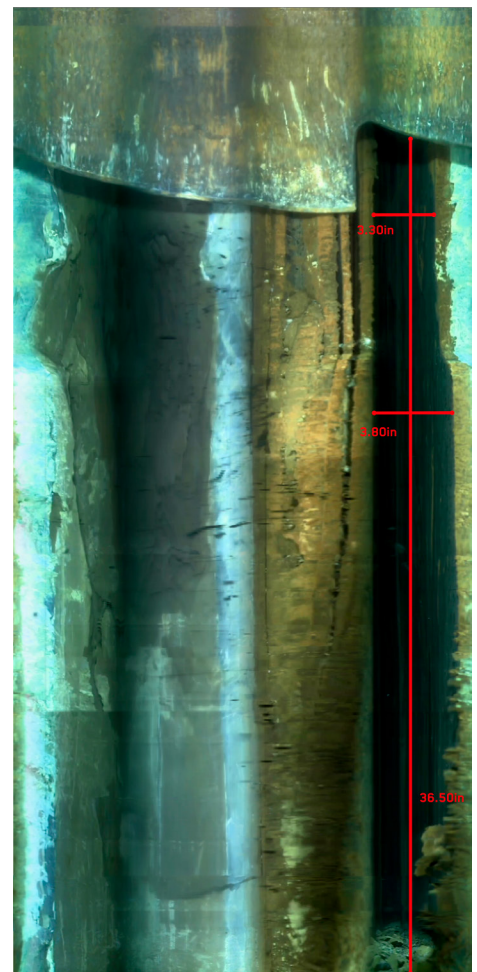
Figure 3: Dimensioned 360° Mosaic image

Armed with this information, and the ability to visualise in multiple formats, the operator was able to make a decision on their next steps and move ahead with the abandonment operation.