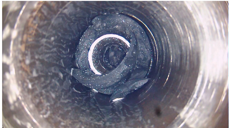
Figure 3: Rubber Seal Fragments Preventing Fishing Attempts