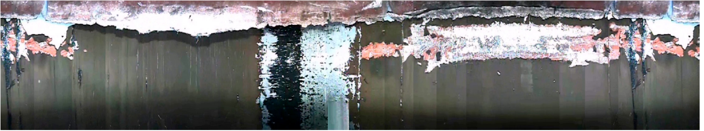
Figure 2: 360 degree stitched image providing a complete profile of the successful cut for clear and concise confirmation

The sideview footage revealed the cut in more detail ( Fig.3 ), showing no anomalies. By applying proprietary Visual Analytics processes, a 360 degree continuous image was generated, providing a complete profile of the successful cut for clear and concise confirmation ( Fig.2 ). Less than 10 metres below, the tail pipe was located standing upright within the 11 ¾ inch casing. With this visual confirmation, the operator was able to proceed with an operation to cut the 11 ¾ inch casing.