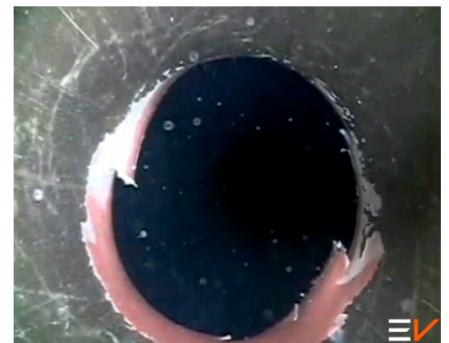
Figure 4: Downview image confirming 11 3/4 inch casing cut