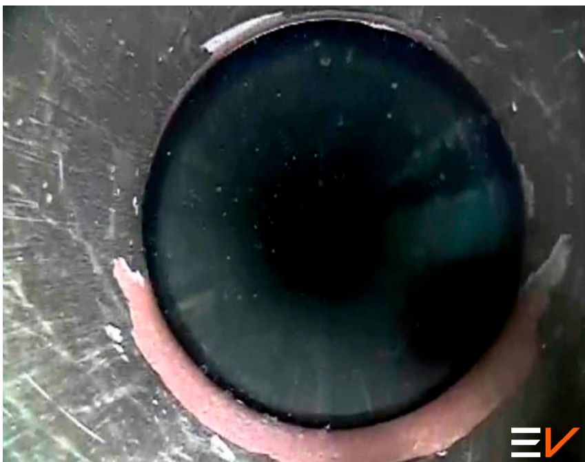
Figure 1: Downview image confirming successful 7 inch casing cut

With multiple cuts required, EV's Optis® R125 camera was deployed on Electric-line to provide real-time visual confirmation of success at each stage of the operation. The camera was run downhole to the target depth, where the detailed real-time footage confirmed the 7 inch casing was successfully cut ( Fig.1 ).