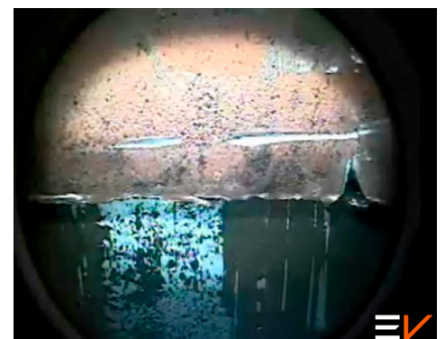
Figure 5: Sideview image confirming final 7 inch casing cut