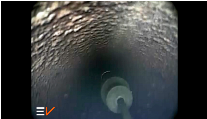
Figure 1: Downview image of stuck tool at 1800m

The camera was run downhole alongside the wireline to locate the stuck tool. Upon reaching 1800 metres, the stuck tool was located sitting on the low side of the well. The wireline was confirmed to be connected to the tool ( Fig.1 ).