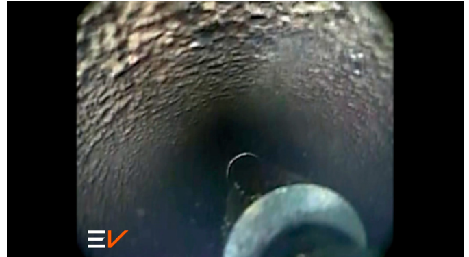
Figure 2: Stuck tool located on lowside of the well

Our customers trust us to provide expert assistance when they need it the most. And this example of resolving complex issues under pressure is one of thousands completed each year by the EV global team.